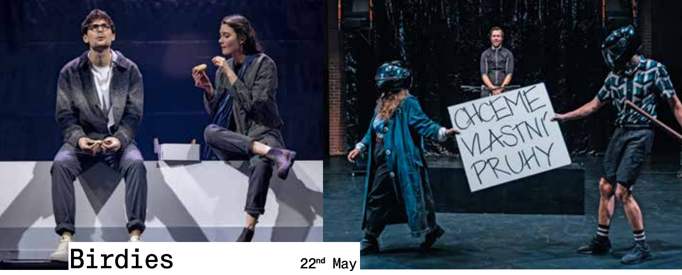
Someday the Kids Will Thanks Us